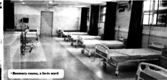
• Recovery rooms, a lie-in ward