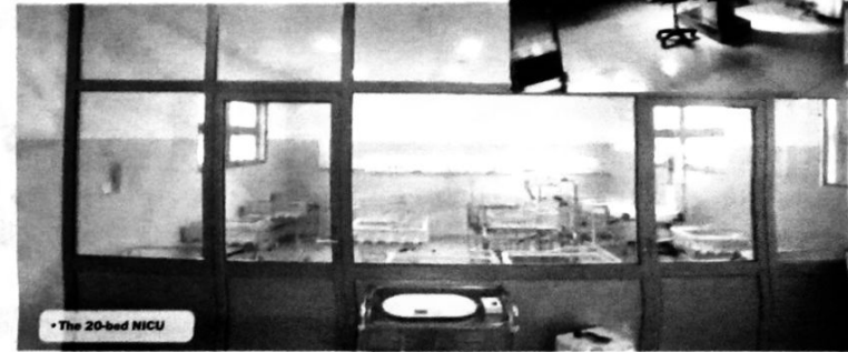
• The 20-bed NICU