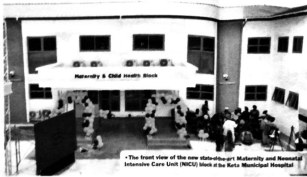
• The front view of the new state-of-the-art Maternity and Neonatal Intensive Care Unit (NICU) block at the Keta Municipal Hospital