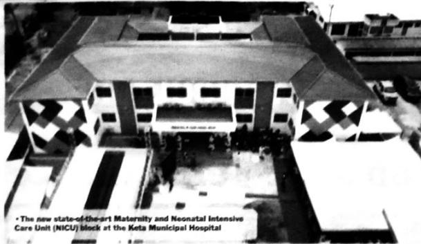
• The new state-of-the-art Maternity and Neonatal Intensive Care Unit (NICU) block at the Keta Municipal Hospital