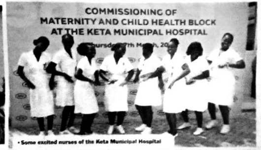
• Some excited nurses of the Keta Municipal Hospital