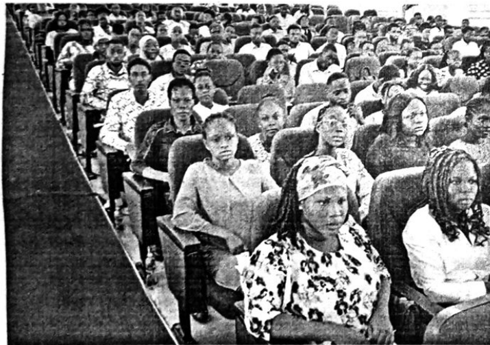
The scholarship beneficiaries