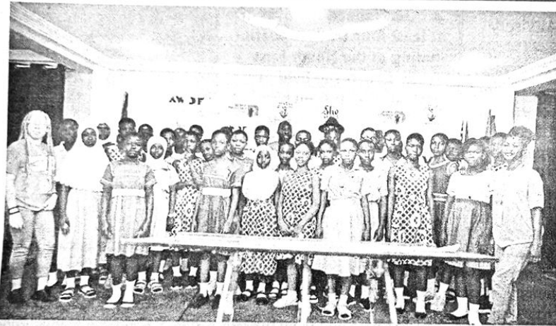
Stakeholders in a group photograph with some of the young girls

The outreach programme for girls with and without disabilities at the PIWC Auditorium at Konongo Ahyiaem in the Asante Akim Central Municipality of Ashanti region was well attended by stakeholders, including representatives from traditional and religious leaders, male