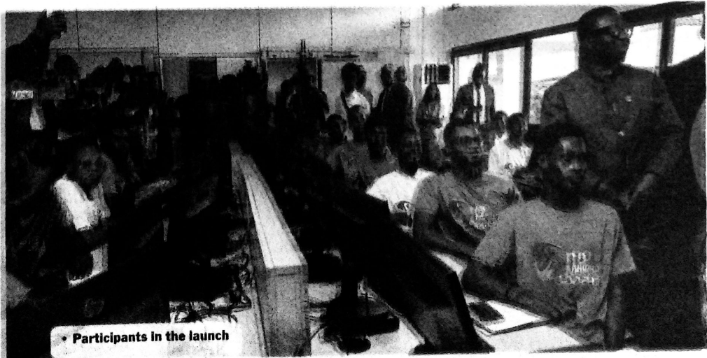
• Participants in the launch

The government formally announced that the programme's pilot phase would begin yesterday, April 16, 2025, initially targeting four regions, namely Greater Accra, Ashanti, Bono, and Upper East, with plans for nationwide expansion.