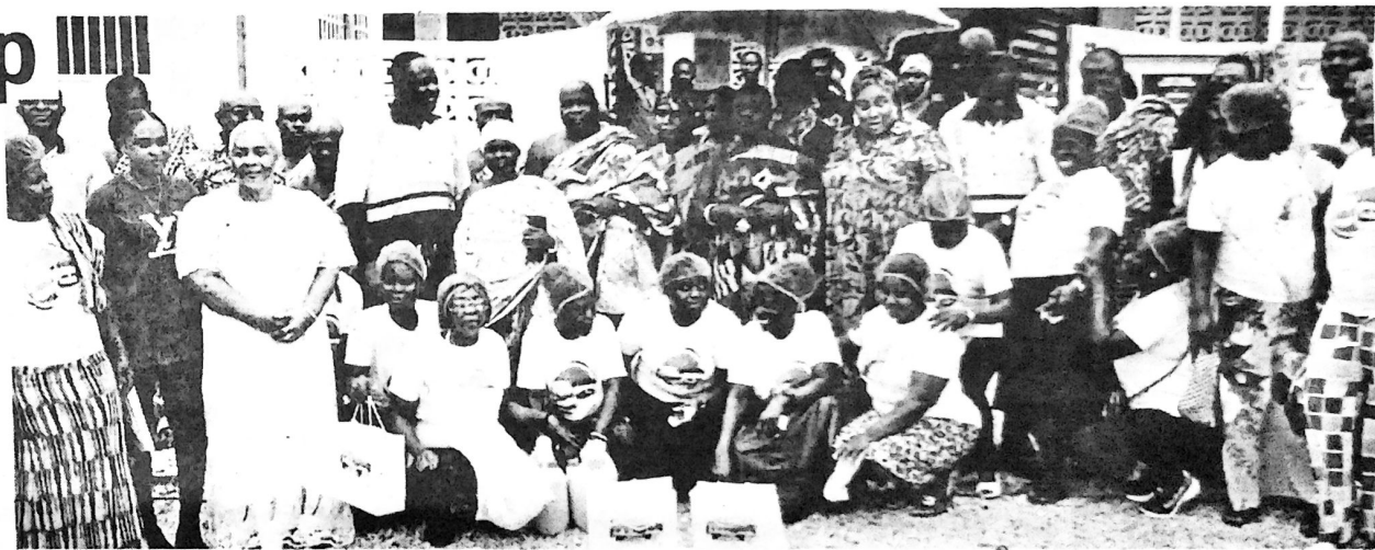
Nananom, AGA Staff, MCE, Dokyiwa Coop Group and other stakeholders in a pose

He also urged the Municipal Assembly to prioritise the development of the Kunka area, noting that the assembly gets most of its revenue from Kunka.