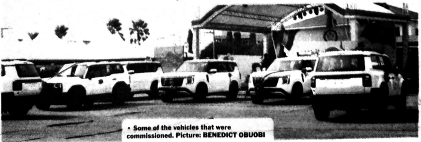
• Some of the vehicles that were commissioned.