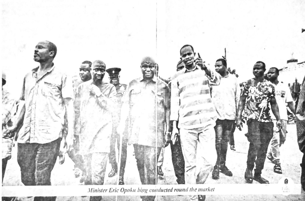
Minister Eric Opoku being conducted round the market

The Minister for Food and Agriculture, Eric Opoku, has paid a working visit to the Ashaiman Livestock Market, the largest livestock market in West Africa, as part of government's commitment to the implementation of the Livestock Development Project (LAP).