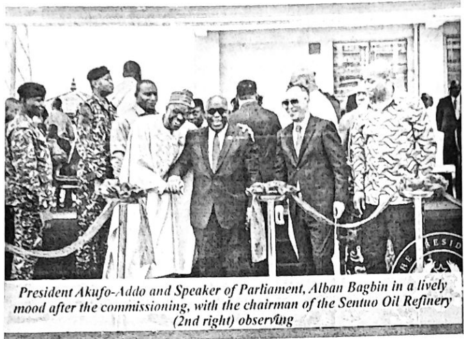
President Akufo-Addo and Speaker of Parliament, Alban Bagbin in a lively mood after the commissioning, with the chairman of the Sentuo Oil Refinery (2nd right) observing