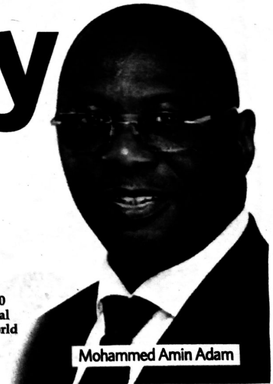
Mohammed Amin Adam