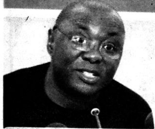
• Dr Mohammed Amin Adam — Minister of Finance