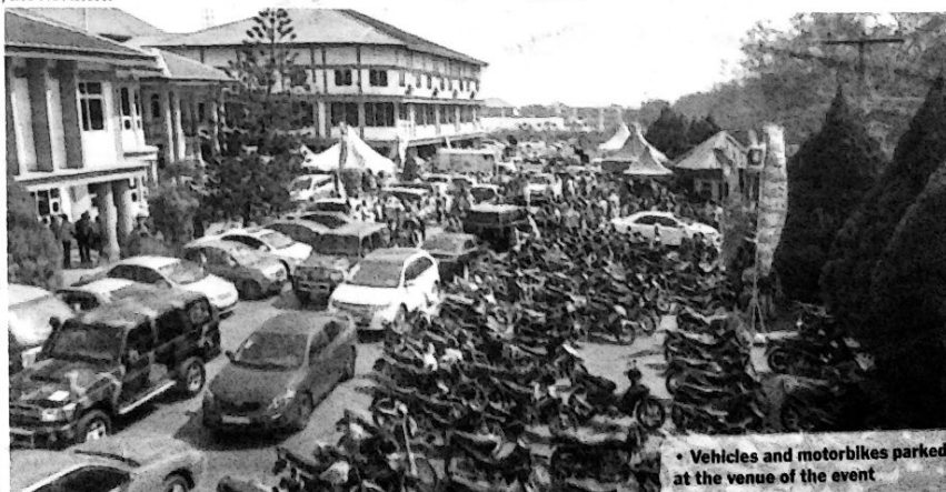
• Vehicles and motorbikes parked at the venue of the event

No part of this publication may be used or reproduced in any form or by any means or transmitted in any form or by any means without prior permission.